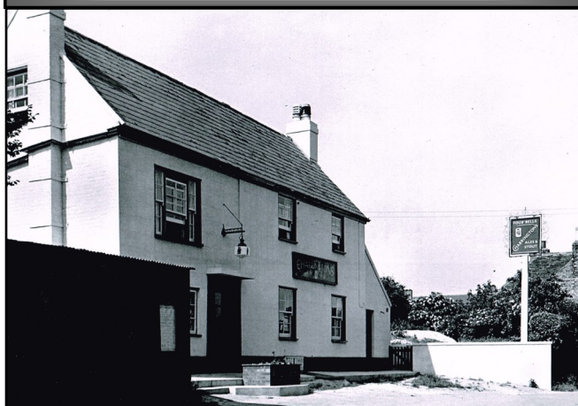
The Four Bells, East Langdon circa 1952

Do you have any photographs of Langdon in a bygone era? We would love to hear from you!