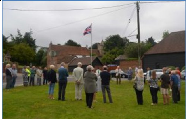
War Memorial Dedication Ceremony 28th July 2019

More information about the names on the memorial can be found at The Dover War Memorial Project www.doverwarmemorialproject.org.uk or the Roll of Honour website www.roll-of-honour.com .