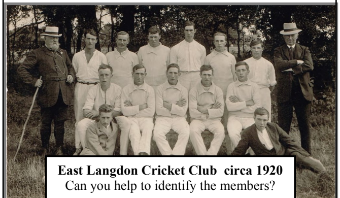
East Langdon Cricket Club circa 1920 Can you help to identify the members?