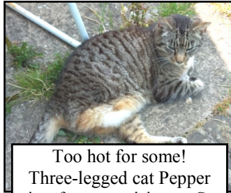
Too hot for some! Three-legged cat Pepper is a frequent visitor to St Augustine's churchyard.

As schools break up for the summer, the warm sunny weather certainly gives a feeling of release from the Covid-19 measures which have restricted our daily lives. Our local wildlife is taking full advantage of the warm conditions; birds are busy foraging to feed their hatchlings, and hedgerows have an abundance of flowers to which butterflies are attracted!